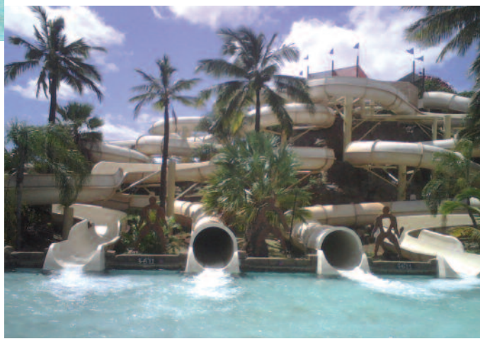
Above: Wet N Wild water park in Kapolei, Hawaii Front cover: Same park after resurfacing by SlideRenu®.

SlideCare is a water slide maintenance products company. We are the only company in the aquatics industry that manufactures a variety of protective restoration coatings, cleaners, waxes, polishes and glazes which have been specifically formulated to restore the “like-new” appearance to dull color faded water slides and aquatic play features. All of our products are environmentally friendly, worker safe and can be applied by your most trusted local painting contractor, internal maintenance staff, seasonal employees or you can hire one of our Certified Applicators.