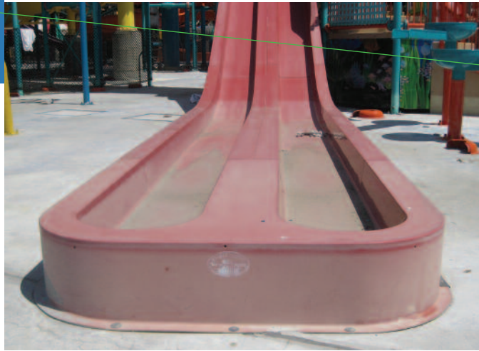
Above: One of the water slides in Hershey Park, Hershey, Pennsylvania. Below: Same slide after resurfacing by SlideRenu®.